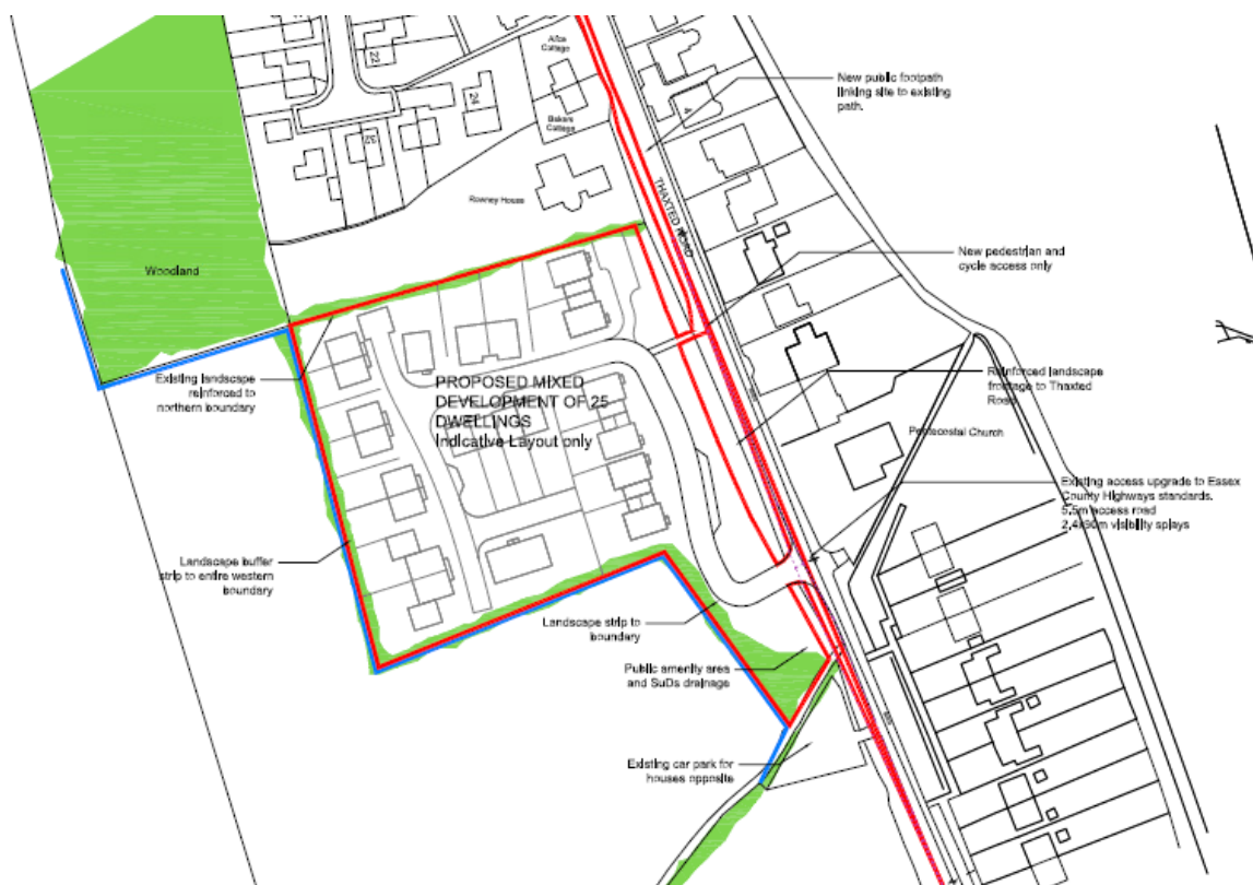
Fig 1 Indicative Site Plan