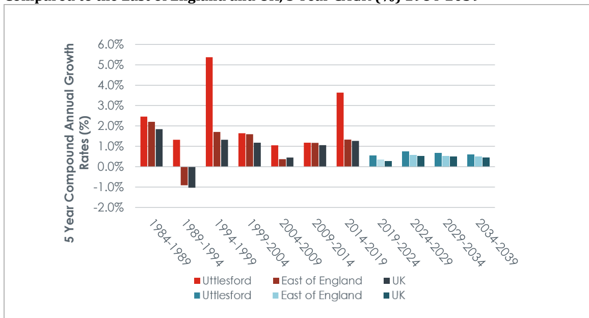
Figure 2-3: Historic and Projected Patterns of Employment Growth in Uttlesford Compared to the East of England and UK, 5 Year CAGR (%) 1984-2039

Source: SQW Analysis of Cambridge Econometrics Forecasts