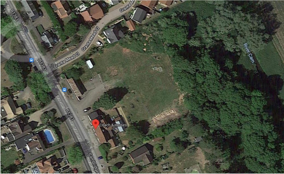
Appendix 4 – View of the site from Google maps