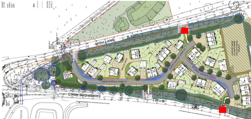
Plan 2 - Originally Approved Scheme

■ = Foot path to be removed under a separate Deed of Variation of the S106 Agreement that formed part of UTT/18/1993/FUL